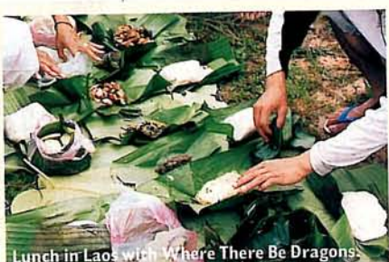
Lunch in Laos with Where There Be Dragons.